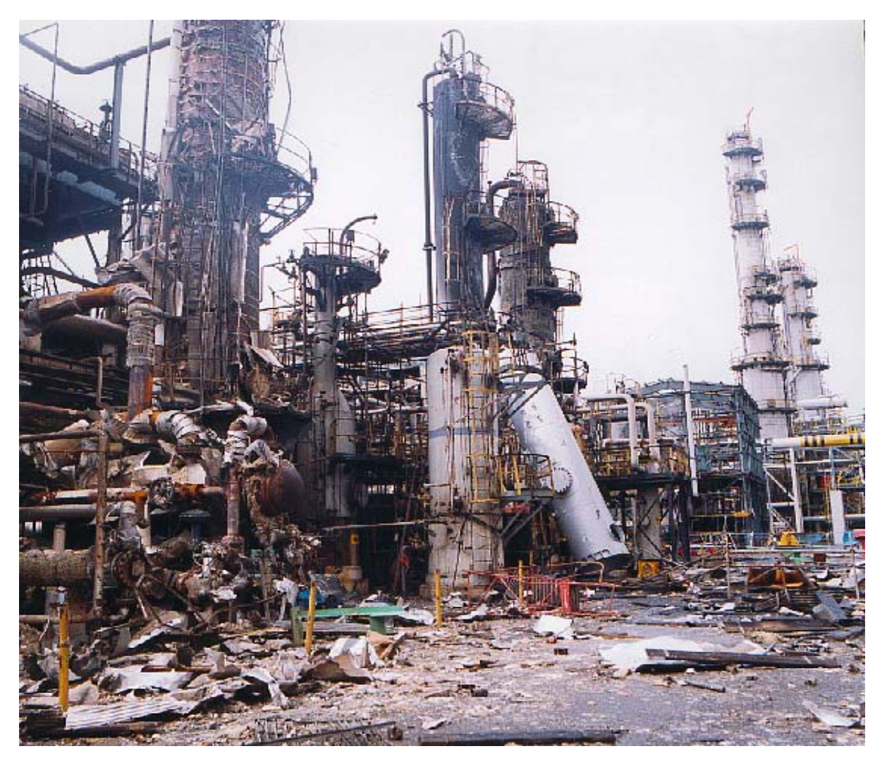
Figure 4 – Damage to adjacent Plant

The damage caused the Refinery to be shut down for several weeks; this was followed by a phased start up.