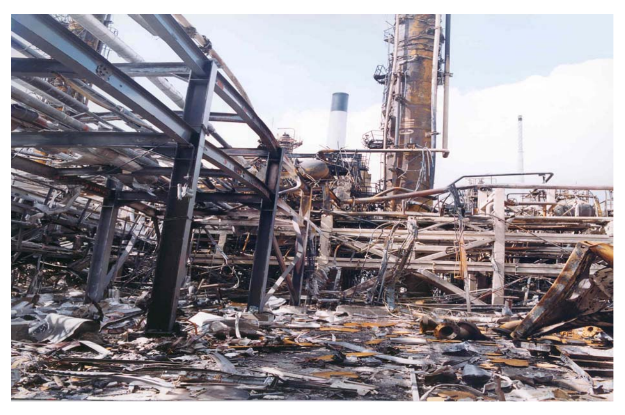
Figure 5 – Close up views of damage to the SGP