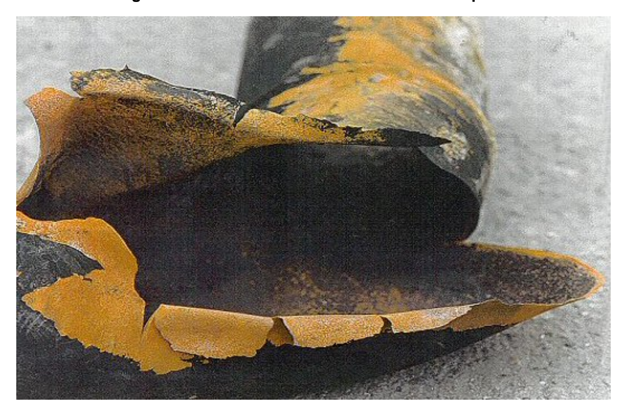
Figure 7 – The failed elbow recovered from the plant

injection was in operation it washed away the protective coating leaving it open to attack by corrosive agents in the gas stream. Hence the elbow was subject to erosion/corrosion, a process that resulted in the thinning of the pipe wall and eventual failure.