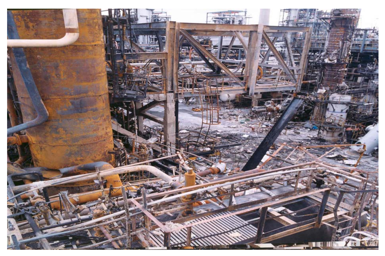
Figure 6 – Close up views of damage to the SGP