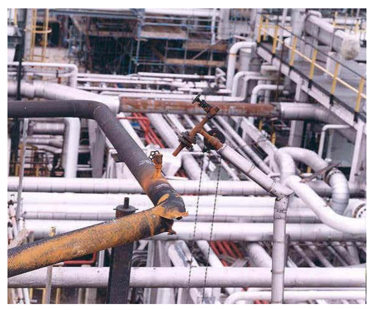
Figure 9 – In-situ failed elbow and injection pipework connection (broken off)

The modification had the hallmarks of a 'quick fix' to solve the symptoms of the immediate problem of fouling. Using an existing vent valve to connect the water into P4363 was expedient, and meant that there would have been little or no downtime required for this modification.