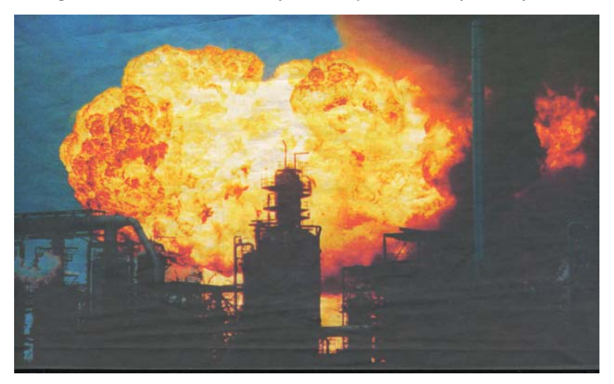
Figure 2 – The fire and secondary fireball

ruptured releasing a huge cloud containing around 90% ethane/propane/butane. About 20-30 seconds later the gas cloud ignited. As a result a massive explosion and fire followed.