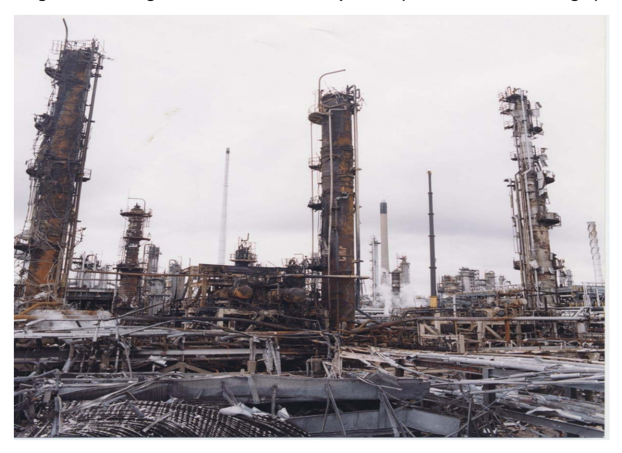
Figure 3 – Damage to the SGP after the explosion (W413 column to the right)

The SGP suffered very heavy damage as a result of the force of the blast. Fortunately, no one had been in the direct path of the estimated 175 metres by 80 metres gas cloud when it had exploded. The resultant fire caused further and substantial damage to the SGP.